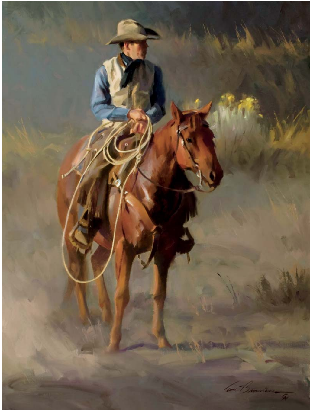
Tom Browning , In The Circle , oil on canvas, 24 x 18"

"It will certainly make for an amazing evening of events for the collectors and the artists," says Smith. "It is a big change that