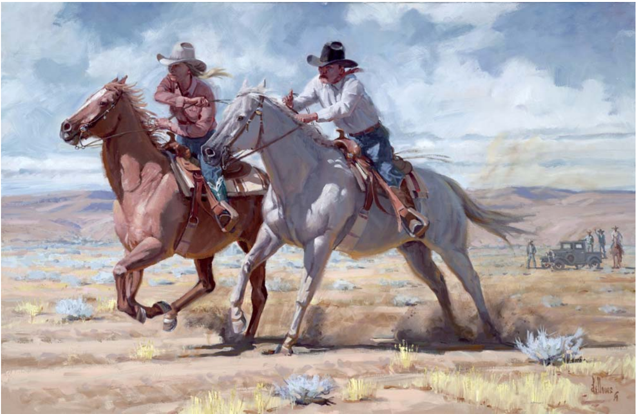
Fred Fellows , The Match Race , oil on linen canvas, 30 x 46"