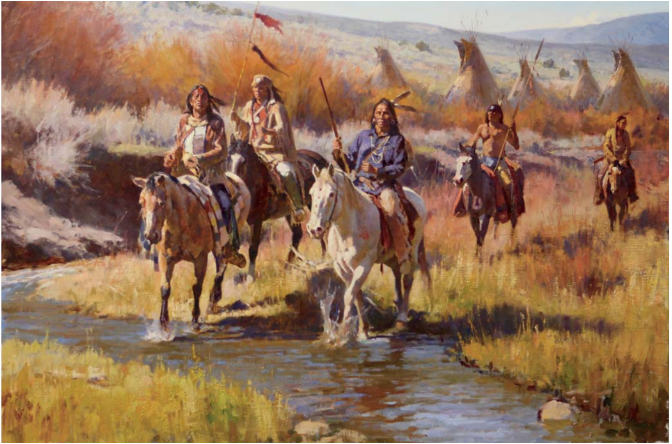
Jim Norton, Comanche War Party , oil on linen, 24 x 36"