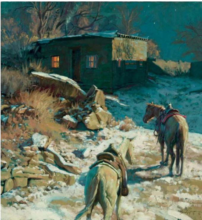
Bruce Greene, The Sound of Guitars and the Laughter of Ladies , oil on linen, 30 x 30"