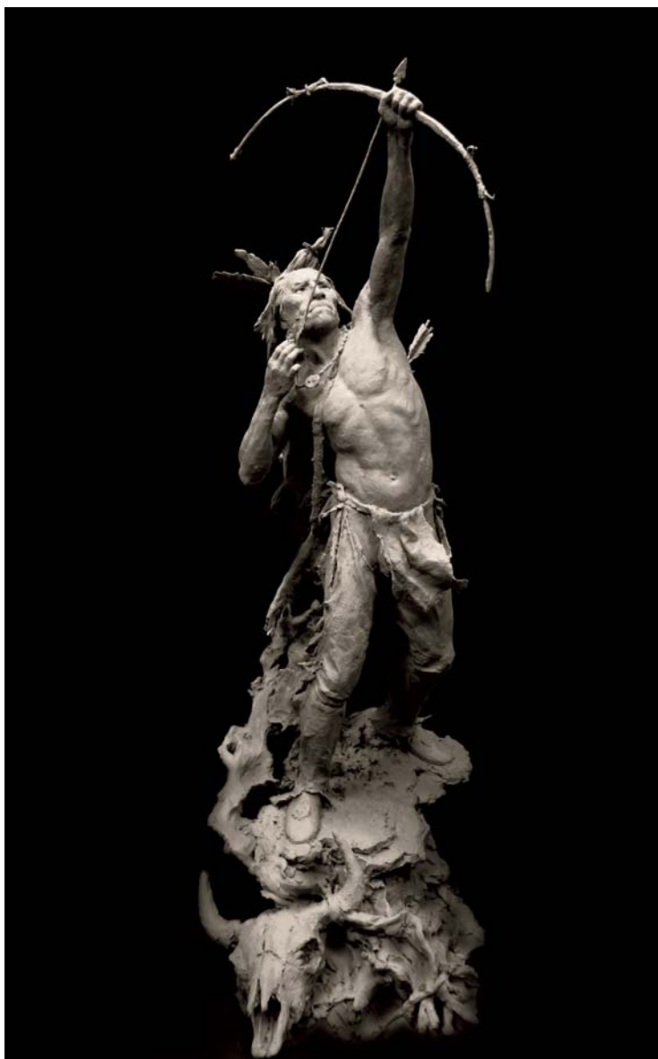
John Coleman , Mystic Smoke and Sacred Arrows , clay for bronze, 39 x 17 x 16"