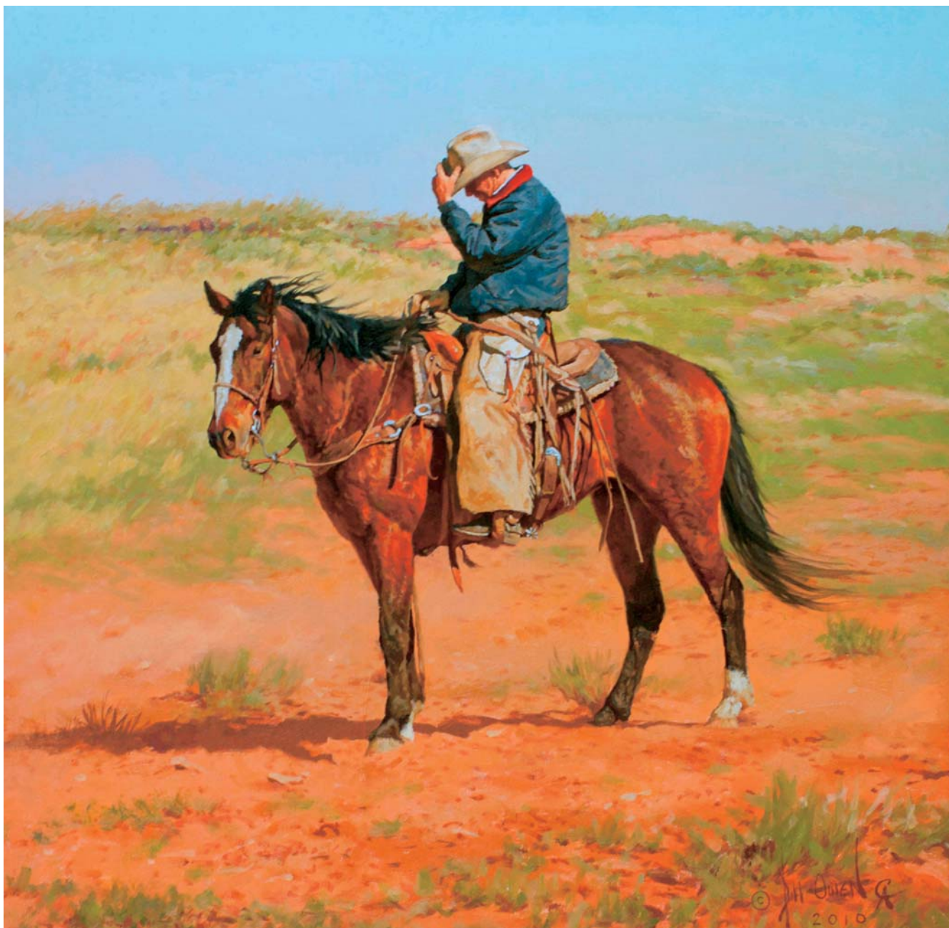
Bill Owen , Windswept Plains of the Co Bar , oil on canvas, 24 x 24"

was ultimately driven by the collectors themselves."