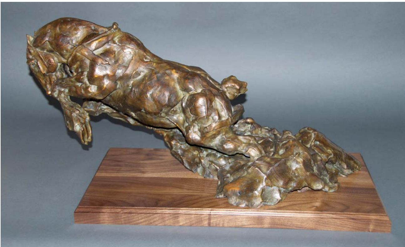
TD Kelsey , Just One More Hill , bronze, 12 x 30 x 11"