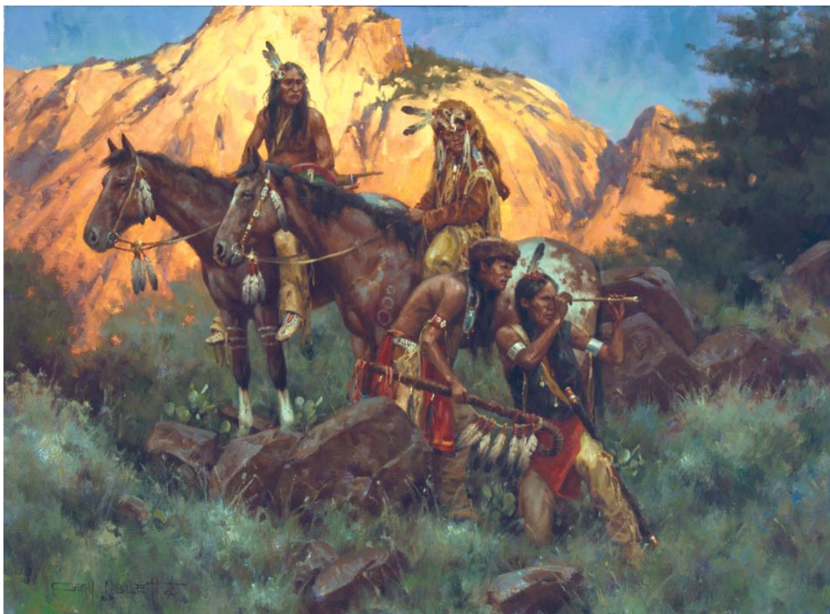
Gary Niblett , Great Clouds of Dust , oil on canvas, 26 x 36"