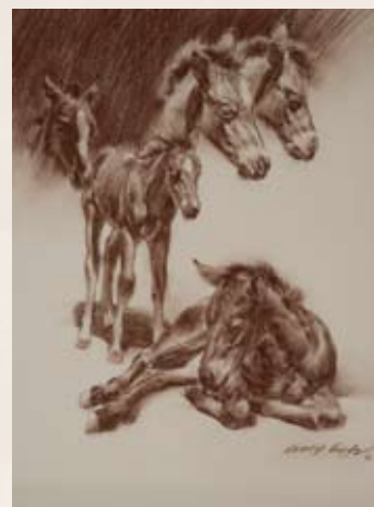
Silver — Drawing and Other Media Loren Entz, Colt Studies