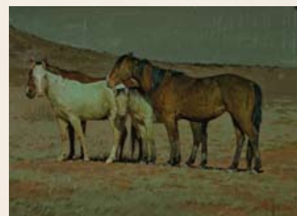
Silver — Oil Bill Owen, Night Life