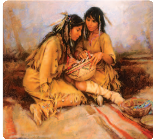
Heritage, Harley Brown, 2006. Pastel, 27" x 29".

Gesso is another material that guests might see at the Sale. Gesso is essentially a primer, and some artists use it to prepare their canvases so they grab paint, charcoal or other materials more easily. It creates a stiffer, less porous support surface so less paint is absorbed. It can