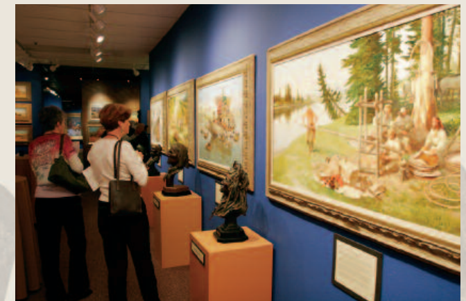
CA Sale patrons enjoying a look around the Bashes' Gallery

away in 1997, he wanted to create a tribute to her that was befitting the nature of their relationship. He dedicated the gallery the Zelma Basha Salmeri Gallery of Western American & Native American Art. Today it houses two distinct collections – Contemporary Western American Art and Contemporary Native American Art – and there are 3,000 works on display. The Contemporary Western American Art collection primarily features art by CAA members.