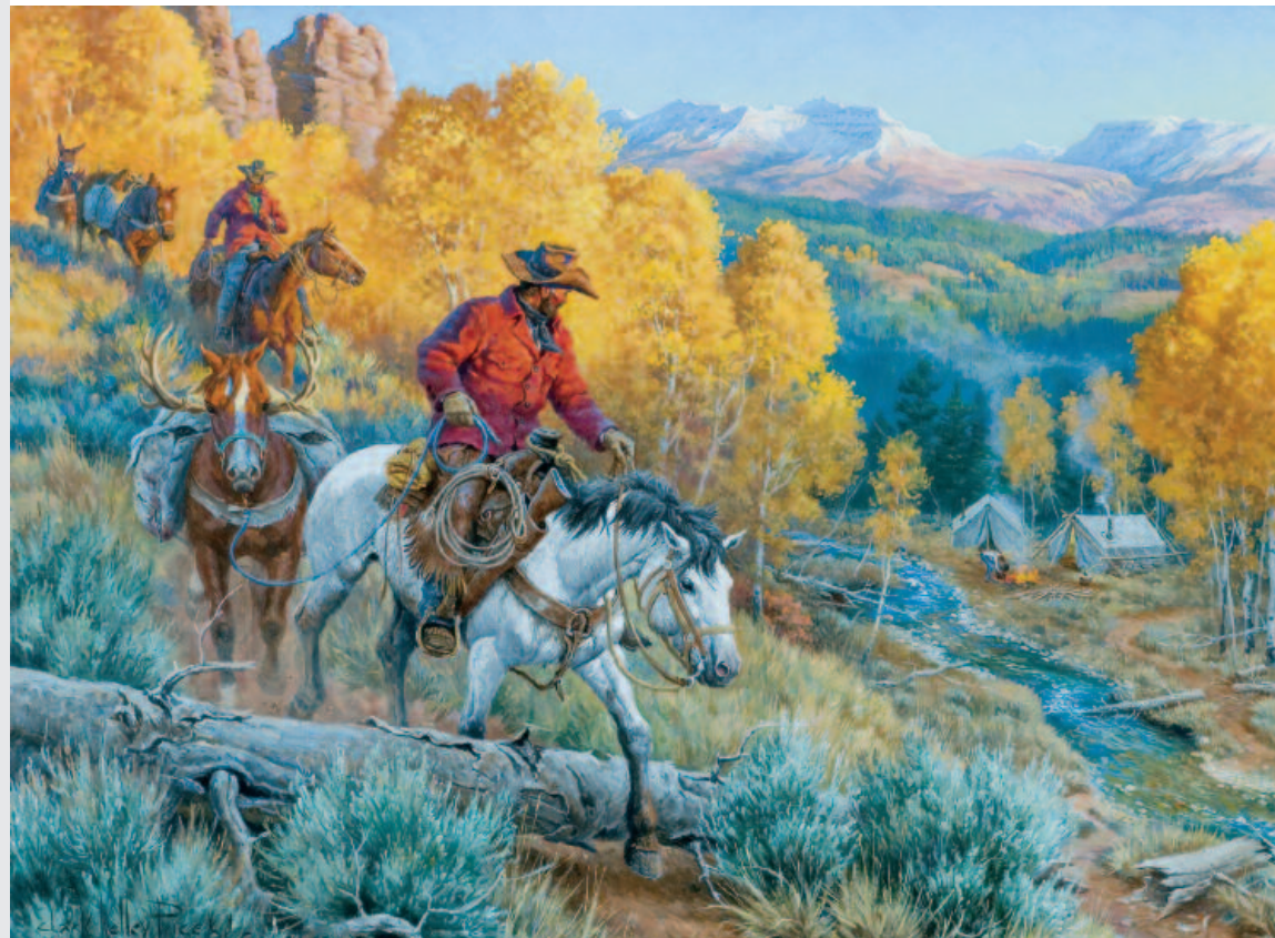
A Welcome Sight, Clark Kelly Price, 2006. Oil on Canvas, 30" x 40".

1625 North Central Avenue Phoenix, Arizona 85004-1685 www.caashow.org